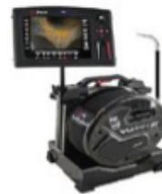
VUMAN® E3/E3+ Grundgerät